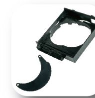
Adjustable air duct for various CPU locations