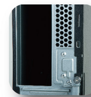
Tool-less top cover

Front Control : USB 2.0 x 2 + USB 3.0 x 2 (Option)