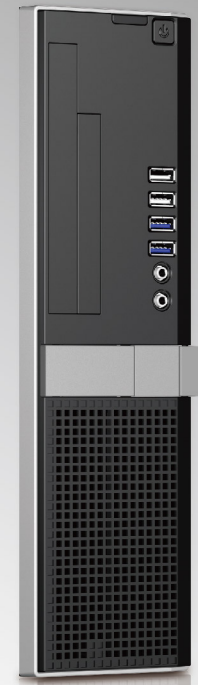
PC72239 (Exclusive in USA)

Front Control : USB 2.0 x 2 + USB 3.0 x 2 (Option)