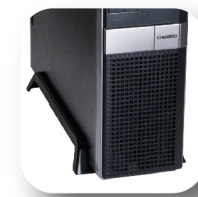
Built-in PC stand